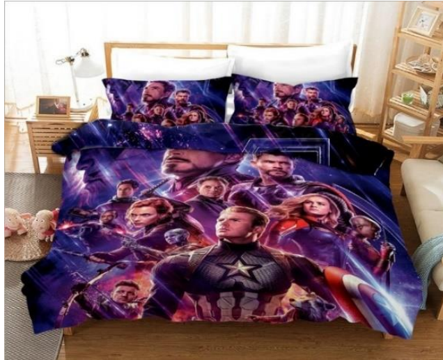
Figure 7. Merchandizing found on the internet and developed on the basis of Infinity War (2018) and Endgame (2019) #2