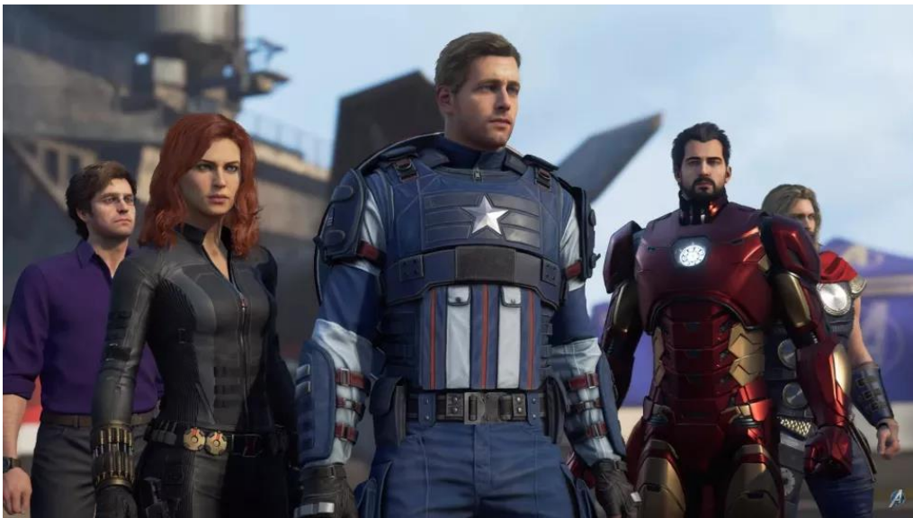
Figure 13. Extract from the trailer of videogame Marvel's Avengers

The aim is to create something that addresses both the general audience and various types of fans, but not necessarily to conquer every one of them. Producers have had to realise that they cannot please everyone, and if they try, it will often result in failure as they did not succeed in gaining the interest of either the fans or the general audience. Even if they always have to try to attract as many people as possible, it is always safe to have a target audience and to focus on it (Gray 2010: 196).