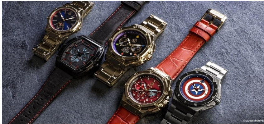
Figure 8. Merchandizing found on the internet and developed on the basis of Infinity War (2018) and Endgame (2019) #3

This merchandising process will often be started during the commercial break of a popular program where the viewers can be the potential future consumers of these products and for example, McDonalds' or other fastfoods may develop a themed "Happy Meal" to promote the products and, therefore, the movie even more. In the case of Endgame , there were indeed small action figures representing the superheroes of the movie in the Happy Meal, so that children could collect them and play with them. 29 A movie is "no longer reducible to the actual experience of seeing it," according to Robert Allen (1999). These merchandises become part of the text and the movie is no longer the primary text, as one can see how all the products developed by Disney contribute so much more of the profit than the tickets bought by viewers in theatres. The boundaries between text and paratext are consequently very confused (Gray 2010: 38-39). Media corporations understand nowadays that it is very interesting to invest in