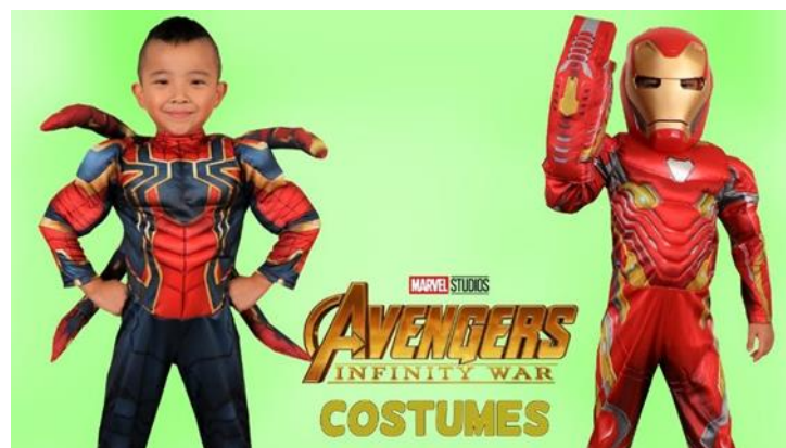
Figure 9. Costumes for children based on Infinity War (2018)

These products are also known as “peripherals,” except that they are everything but peripheral. They often have a huge impact on the expansion of a movie (Gray 2010: 175). These new gadgets or architexts remind players of their own experience with a movie or a comic, or even a videogame, and therefore, with this form of proximity, and also of common culture, they are more tempted to buy the products, and to replay scenes that they have already seen before (Letourneux 2017: 458/462). Indeed, they offer children a form of escape from the routine of daily life, reaching fantasy through different invented scenarios. There is also the concept of costumes, made for children and enabling them to enter their favourite world by pretending to be their favourite superhero. What matters therefore is the collective imagined work of individual productions, reaching for brands’ commercial and economic successes (Letourneux 2017: 462-463). These products are not narrative, but narrativity carriers (Letourneux 2017: 460).