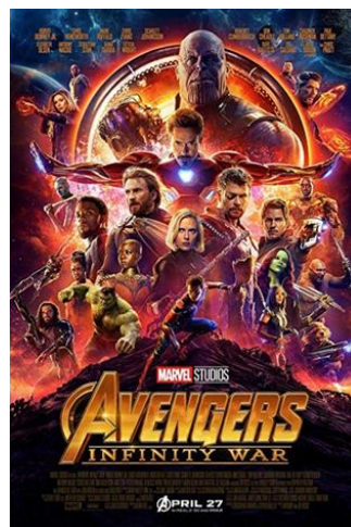
Figure 1. Official movie poster of Infinity War (2018)

Movie posters are also crucial in the development of meaning. They can set up the gender, genre, style and attitude towards the movie before its release (Gray 2010: 49). Nevertheless, there is a relatively limited set of posters printed to go with each film. For example, action movies often present the male (or female) hero “looking steely-eyed and ready for action, with weapons on hand and/or muscles bulging”. Another example can be horror movies, where we can either see the murderer or a character representing innocence that has been disturbed (Gray 2010: 53). These styles were developed so that the future audience can directly understand which genre to expect and which stars will be in the movie. Therefore, the main role of a poster can be said to open a movie's story world before the actual release.