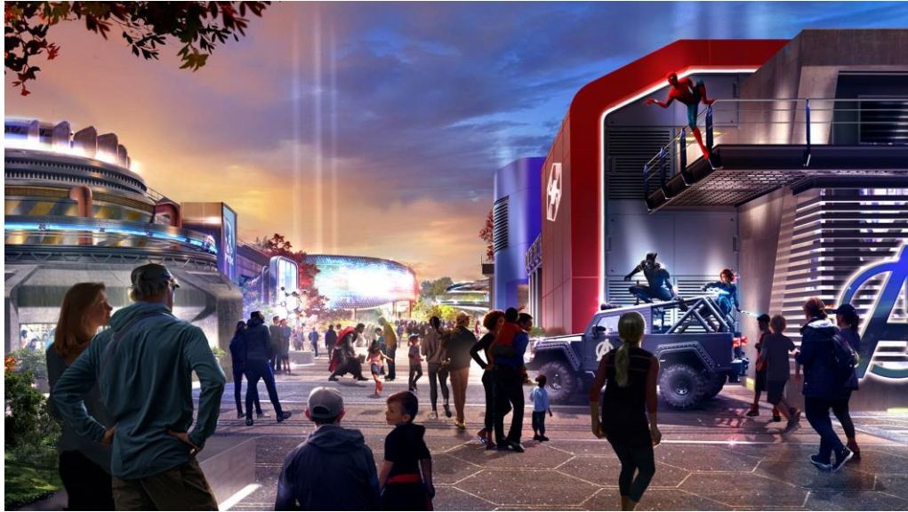
Figure 14. Disney's released picture of Marvel-themed parks #1