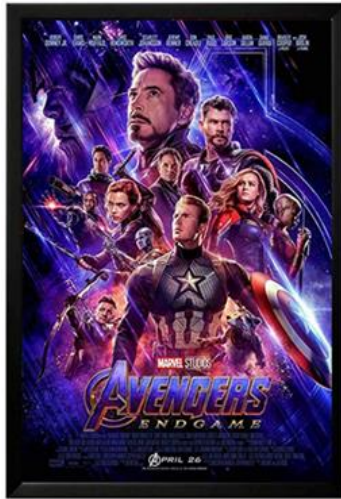
Figure 2. Official movie poster of Endgame (2019)

The images demonstrate how the movie posters of Infinity War (2018) and Endgame (2019) are very similar in their structure. They aim to present as many superheroes as possible and in fact, present them to the audience, so that future viewers already have an idea of how big these movies are going to be as it is the first time that all these superheroes have appeared together.