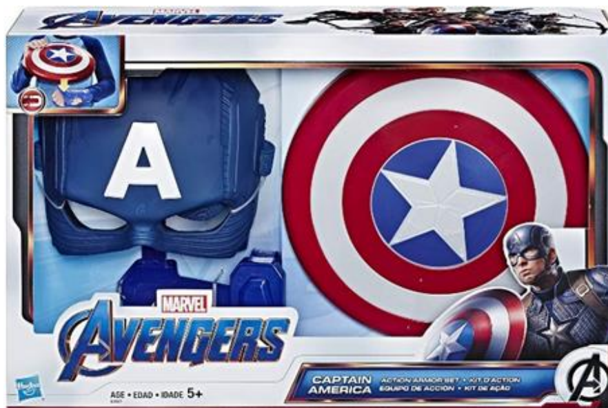
Figure 11. Accessories sold by Marvel Studios, on the basis of its characters' weapons #2

Therefore, architextual encyclopaedias can be seen as sets of props (Letourneux 2017: 465-466). These encyclopaedias function as fiction “catalysts”, describing universes, but more than that, suggesting the many other possibilities and games that can emerge in the future, on the basis of the already collected information (Letourneux 2017: 466). To summarize, these encyclopaedias are full of props and their aim is to go from a narrative to a non-narrative logic, but with a number of intertexts and architexts that the reader or viewer must exploit, to reach that form of fantasy, derived from narrativity (Letourneux 2017: 469). As far as Marvel is