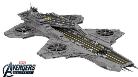
Figure 12. Avengers Helicarrier as a toy

Toys and games increasingly exploit the success of franchises since the interbellum. They have based their toys and games on thematised architexts (features of characters, of settings, vehicles, etc.) that they restructure so that they become playful for children and young people (Letourneux 2017: 472). The manufacturers of these toys try to institute a coherence between the products and the universe, so that the players want to collect as many plots as possible (Letourneux 2017: 472-473). In transmedia series, these derivative products are therefore part of an already constituted universe. The players are appropriating the original work and its universe, in order to propose new alternatives to the plot (Letourneux 2017: 475). A series is therefore always open to new fictional expansions and fans or collectors participate in the spreading between producers and receivers, by developing a sense of appropriation (Letourneux 2017: 476).