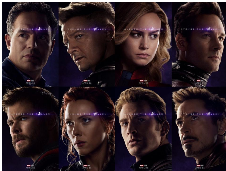
Figure 3. Endgame : some of the Survivors posters

gathered in the movie (Screenrant 2019). The brand did the same for Endgame (Comicbook 2018), with only one slight difference: the characters that had been wiped out by Thanos in Infinity War , appeared in a poster in black and white, showing people that they were (supposed to be) dead. Each poster has the words "Avenge The Fallen" written over the characters' faces. It accentuates the dramatic side of the movie and shown to the fans that it was again something that had never happened in the past Marvel movies. It also maybe suggested that even if these characters were supposed to be dead, their presence on an individual poster could imply a new role that they would play in Endgame , and their fate was maybe not defined forever.