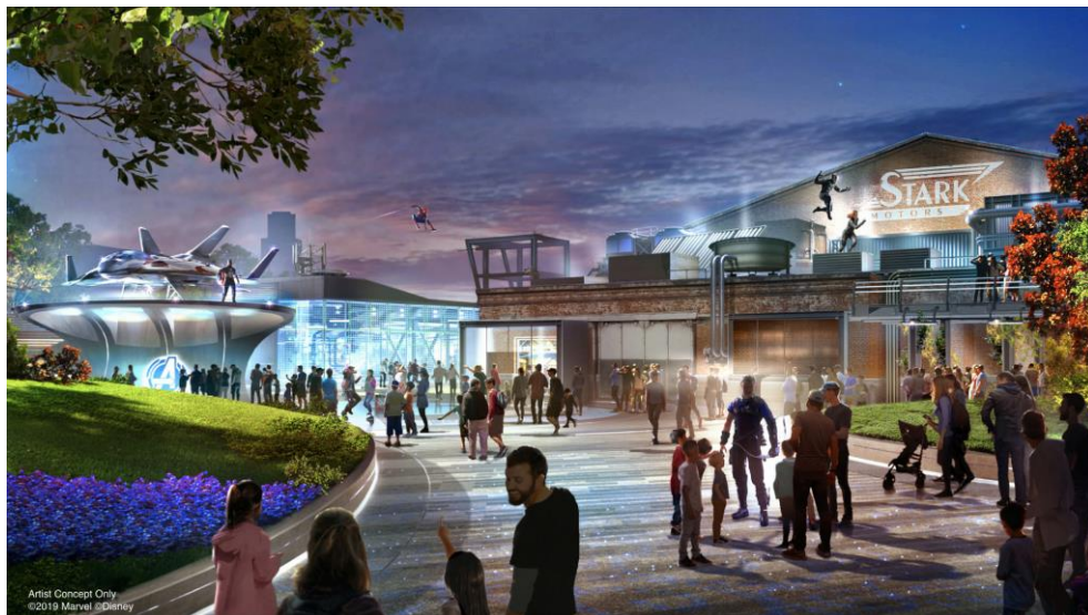
Figure 15. Disney's released picture of Marvel-themed parks #2

In 2018, Marvel announced that three new Disney parks based on the Marvel universe and characters would be developed so that fans could live a new immersive experience. Spider-Man seems to be the hero of choice for California's Disney park, Iron Man for the Paris' park and Ant-man and the Wasp for the Hong-Kong park. Of course, all the Avengers will be added to these new immersive parks ( The Verge 2018). Marvel Studios even posted a short video to promote these new parks, saying that the recruitment would soon begin. 30 Once again, Marvel and Disney remained very secretive about what would actually be on show in these parks, wanting to surprise fans as much as possible and maybe avoiding spoilers for future films as