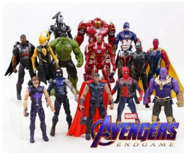
Figure 6. Merchandizing found on the internet and developed on the basis of Infinity War (2018) and Endgame (2019) #1

Children and young people in general like to enter their favourite universe and play within it. The world they are playing in is created in their imagination by themselves, based on narrative productions. A lot of mimicry games borrow these imagined universes and invent a kind of sequel to the original work (Letourneux 2017: 456). Characters, transmedia universes, serial forms, etc. are, in their own way, expansions of the original work and they invite the consumer to imagine new plots, new interpretations, new sequels (Letourneux 2017: 457). Movies often tend to develop what is called "supportive intertextuality". One strategy is to create and sell different kinds of toys, books, watches, bedspreads, and action figures before the release of a movie (Gray 2010: 38). This is what Disney does for example and as we know that Marvel was purchased by Disney in 2009, it will come as no surprise to learn that they use the same system for Marvel movies and that it works. There are indeed many toys, action figures, accessories, developed and based on Infinity War and Endgame , so that fans can publicly express their love and dedication to the franchise and for the stories, continuing their own narrative plot with many gadgets.