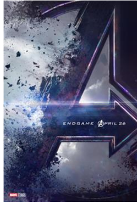
Figure 5. First movie poster of Endgame (2019)

From this it can be concluded that movie posters convey a message and a potential interpretation to fans and other viewers that do not know the text and the movie. Here is the first poster of Endgame , directly referring to the fallen heroes of Infinity War , as the symbol of the Avengers (“A”) appears to be disappearing. Posters also allow fans to imagine and deduce certain things from what they see. For example, at the end of Infinity War , the viewer was unaware of the fate of certain characters, such as Shuri, Black Panther’s sister. Here with her poster in black and white, the fans found out that she has fallen too, and they were even more upset as they were secretly hoping that she had survived. Of course, this is only based on movie posters, but these posters are one of the many paratexts around the movie or program that help to forge people’s mind, interpretation and meaning before the release. Moreover, fans are not stupid, and they know that Marvel and Disney cannot kill too many characters at once, and particularly not new characters who are barely known by the fans and who could be developed much further in the future.