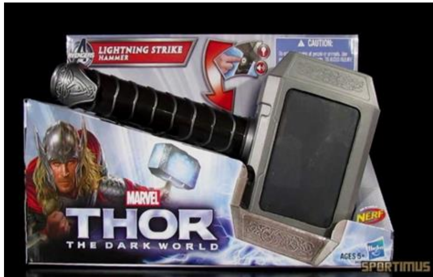
Figure 10. Accessories sold by Marvel Studios, on the basis of its characters' weapons #1

fictional works can be seen as props, such as a cowboy hat or pirate eye patch. In Marvel Studios, there is for example Thor's hammer or Captain America's shield.