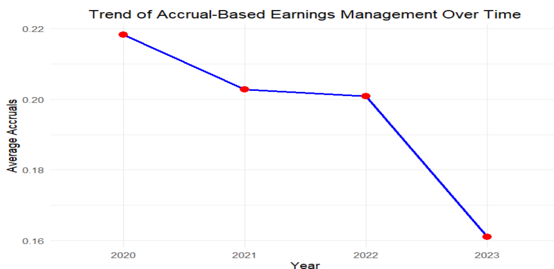
Figure 1: Trend of Accrual-Based Earnings Management Over Time

The analysis revealed that the COVID-19 pandemic significantly boosted accrual-based earnings management. The positive coefficient associated with the COVID-19 variable indicates that firms increased their use of accrual-based strategies during the pandemic. This suggests that companies might have aimed to smooth their earnings, presenting a more stable financial appearance despite the economic challenges. Prior studies, such as Kousenidis, Ladas, & CI, (2013), have documented increased earnings management during economic downturns, particularly through accruals. The current study extends this literature by confirming that similar trends were observed during the COVID-19 pandemic, a unique global crisis.